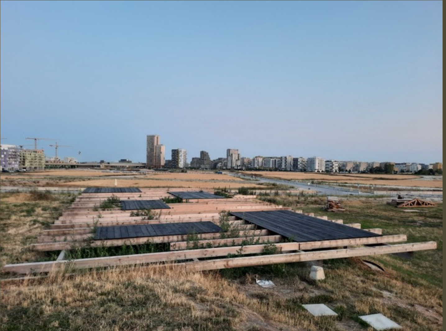
Main installation - foundation of Notgalerie, photo © Reinhold Zisser

The Notgalerie Seestadt - DREAM ESTATE project is an attempt to create a sculpture park in the Seestadt urban development district, an area northeast of Vienna where a satellite city has been under construction for about ten years. Located opposite the subway station that connects the Seestadt with the city center, DREAM ESTATE was created in 2021 as a result of the art project Notgalerie . It features an installation consisting of a multi-part platform covering an area of 15,000 square meters. In total, there are eight individual platforms on the site, as well as the main installation which formed the foundation of Notgalerie.